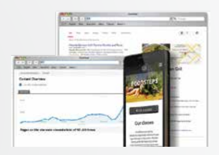
Improved branding and visibility online